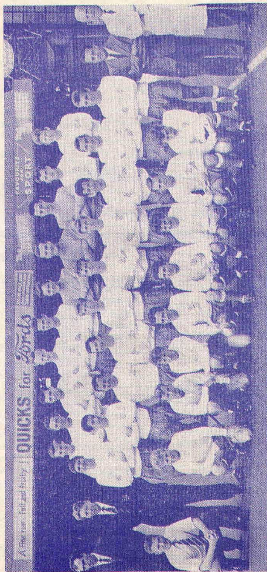
Officials and playing staff pictured on the eve of what every supporter will hope is a very successful season.